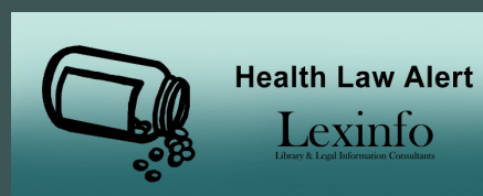
Health Law Alert (monthly)