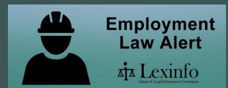
Employment Law Alert (weekly)