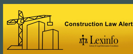
Construction Law Alert (monthly)