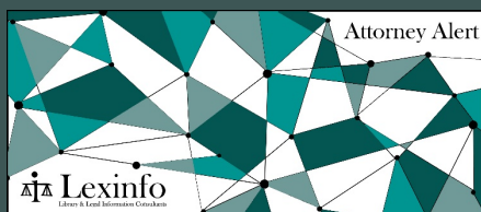
Attorney Alert (weekly)

The following alerting services are available from Lexinfo CC. Email alert@lexinfo.co.za for more information.