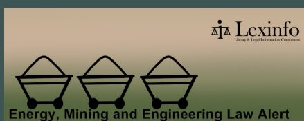
Energy, Mining and Engineering Law Alert (monthly)