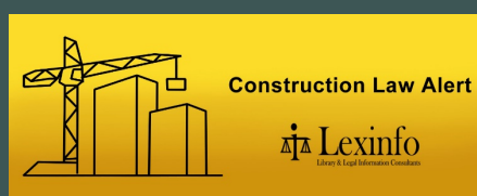
Construction Law Alert (monthly)