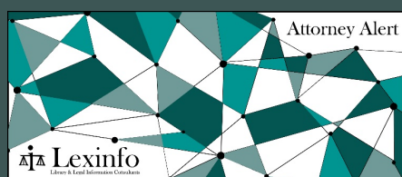
Attorney Alert (weekly)

The following alerting services are available from Lexinfo CC. Email alert@lexinfo.co.za for more information.