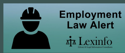
Employment Law Alert (weekly)