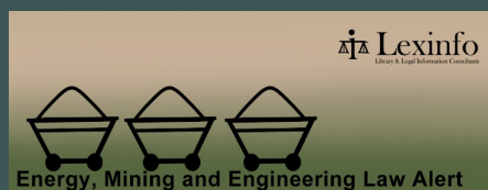
Energy, Mining and Engineering Law Alert (monthly)