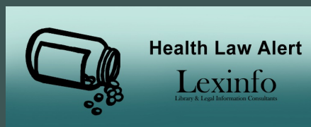
Health Law Alert (monthly)