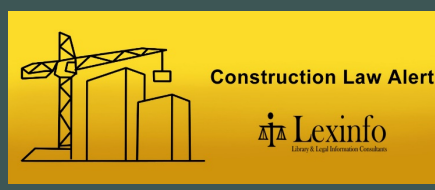
Construction Law Alert (monthly)