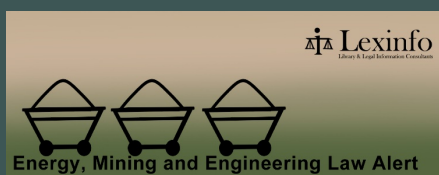
Energy, Mining and Engineering Law Alert (monthly)