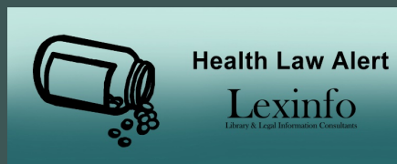
Health Law Alert (monthly)