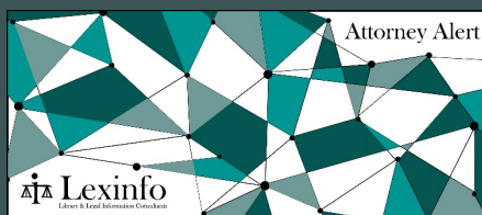
Attorney Alert (weekly)

The following alerting services are available from Lexinfo CC. Email alert@lexinfo.co.za for more information.