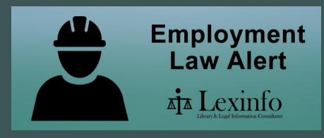
Employment Law Alert (weekly)