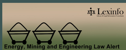
Energy, Mining and Engineering Law Alert (monthly)