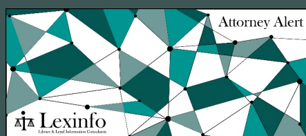
Attorney Alert (weekly)

The following alerting services are available from Lexinfo CC. Email alert@lexinfo.co.za for more information.