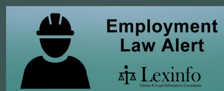
Employment Law Alert (weekly)