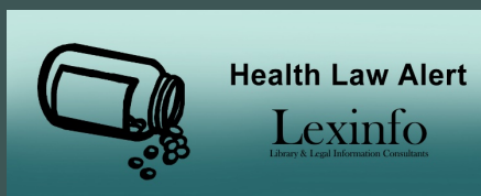
Health Law Alert (monthly)