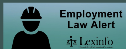
Employment Law Alert (weekly)