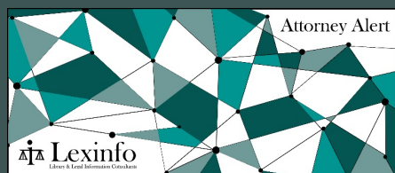
Attorney Alert (weekly)

The following alerting services are available from Lexinfo CC. Email alert@lexinfo.co.za for more information.