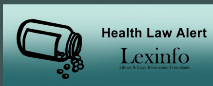
Health Law Alert (monthly)