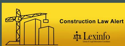
Construction Law Alert (monthly)