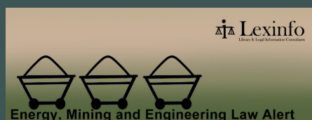
Energy, Mining and Engineering Law Alert (monthly)